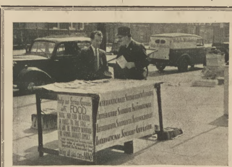
R.C.P. BOOKSTALL.—International socialist Literature bookstall run by the East London Branch every Saturday in Whitechapel Road. Marxist classics, works by Lenin and Trotsky, and Fourth International papers in all languages are sold.

When the men refused to enter the swamp they were told to sit in the road while one of the guards returned to the camp to report the situation to the warden. Only two guards remained with the men who were perfectly aware of the fact that there were fifteen heavily armed guards back at the camp. "It was pointed out to the investigators by one of the prisoners, that if an escape had been con-