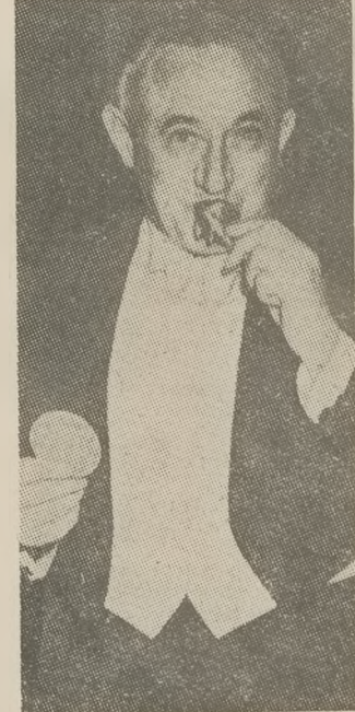
SHINWELL eating Scab-served Chicken.

Dorman Long Ltd., and is on the Executive Committee of the Iron and Steel Federation. The Savoy Hotel Ltd., net the struggle of the catering trades capital, £988,934, controls the struggle of the catering trades workers for union recognition. Profiteers who are anti-labour to Simpson's. This combine made a the Metropolitan Housing Co. The previous night he had been at Claridges, as guest of honour of at Claridges, as guest of honour of the "scores of partridges, sides of beef, roast duck and grilled turbot" they had anticipated were left half-cooked, and they had to be content with bread and cheese. ("Daily Mail," More and the Metropolitan Housing Co. The previous night he had been at Claridges, as guest of honour of at Claridges, as guest of honour of the "scores of partridges, sides of beef, roast duck and grilled turbot" they had anticipated were left half-cooked, and they had to be content with bread and cheese. ("Daily Mail," More and the Metropolitan Housing Co. The previous night he had been at Claridges, as guest of honour of the "scores" of partridges, sides of beef, roast duck and grilled turbot to the core.