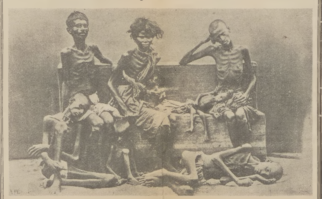
Indian Famine 1942.—This picture shows the condition to which millions of Indian workers and peasants were reduced in the last famine in which millions died of hunger. According to the "Daily Mail", 100,000,000, one quarter of the entire population of India are threatened with starvation. These are the benefits of British rule

On September 18th, Truman states that the problem of feeding Europe was "mainly financial." On October 26th, in the Food fuel to the Argentine, where maize was being used as fuel: