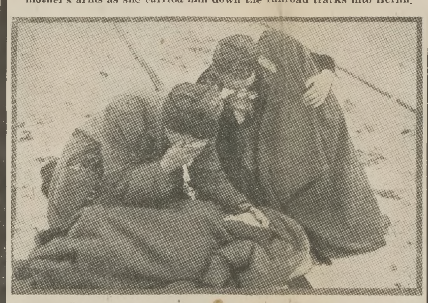
She lays his body on the tracks while another mother and child weep beside her. The survivors reached the British zone of Berlin but found it stripped almost bare of food by the horde of refugees which has poured in from the east

One 8-year-old boy survived the 270-mile journey, only to die in his mother's arms as she carried him down the railroad tracks into Berlin.