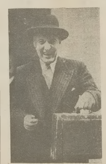
PRODUCES A CAPITALIST BUDGET

of the City and the Stock Market. On April 15th, the Financial Times