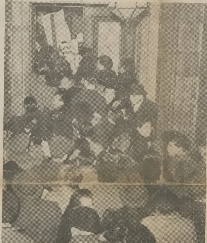
carried by our comrades.