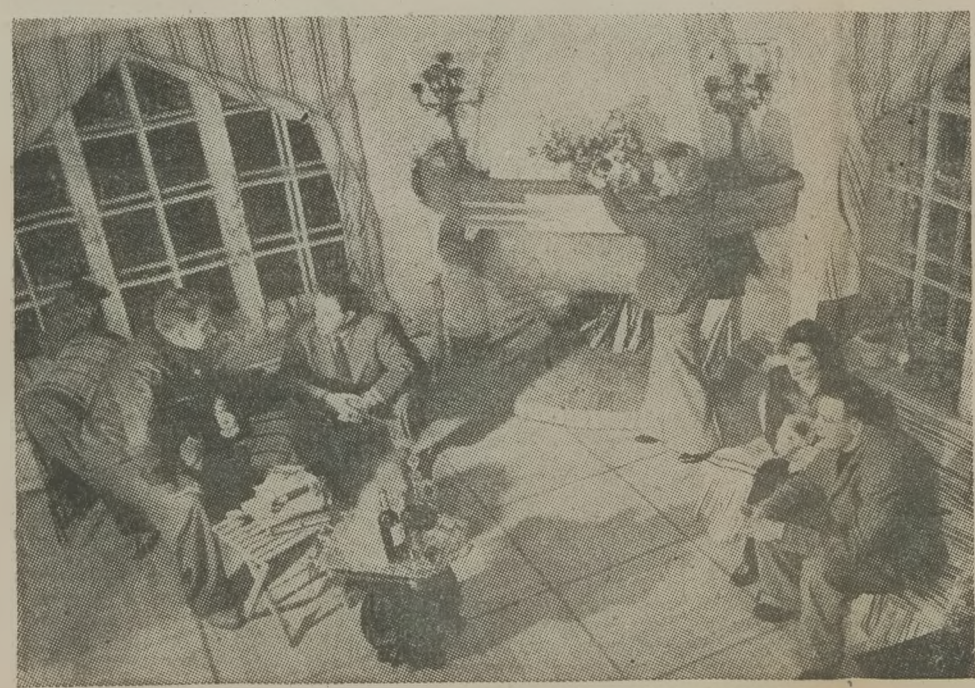
A SCENE AT THE DACHA

At the dacha there were six servants before the outbreak of the war and two automobiles. But since the war, as a patriotic gesture, she sent four servants into the factories, and gave one car to the Government. The only people in Russia with such comforts are the top ranks.