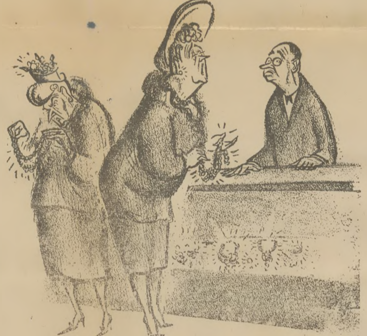
"IT'S SO DIFFICULT TO KNOW WHAT TO INVEST IN THESE DAYS."

In the same way we attacked the Communist Party because of the policy it pursued in allying themselves against the miners in their struggle. We condemned the